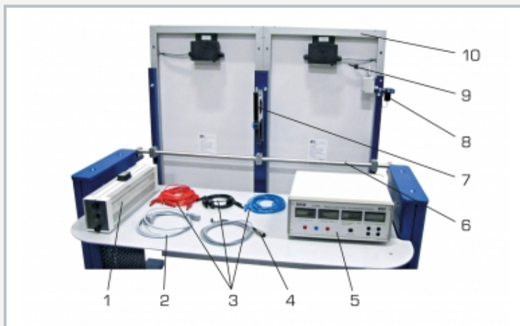
1 slide resistor, 2 power cable, 3 set of cables for parallel and series connection, 4 measuring cable, 5 measuring amplifier, 6 inclination axis, 7 inclinometer, 8 illuminance sensor, 9 temperature sensor, 10 solar modules